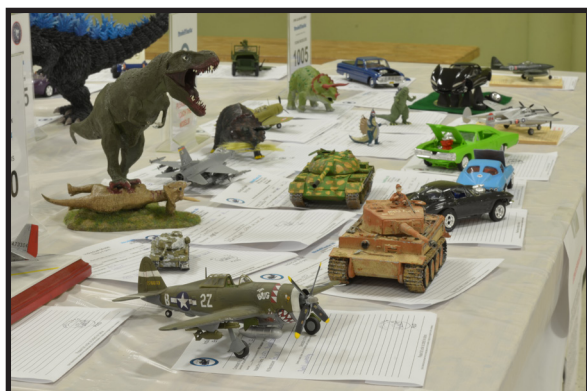
MODELFiesta YOUNG MODELER CATEGORIES

MODELFiesta IS MADE POSSIBLE THROUGH YOUR PATRONAGE AS WELL AS SUPPORT FROM OUR VENDORS AND SPONSORS ...BE SURE TO SUPPORT THEM DURING AND AFTER THE SHOW.