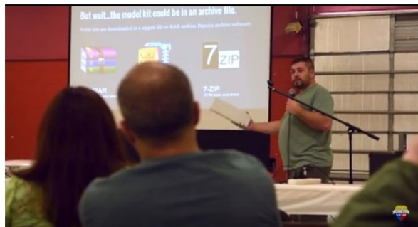
HOW-TO SEMINARS THROUGHOUT THE DAY